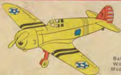
Curtis Hawk P-36A

35c ea. or 3 Kits for . . . $1.00 Postpaid